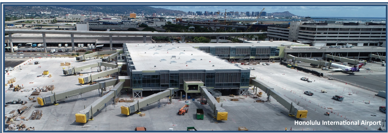
Honolulu International Airport